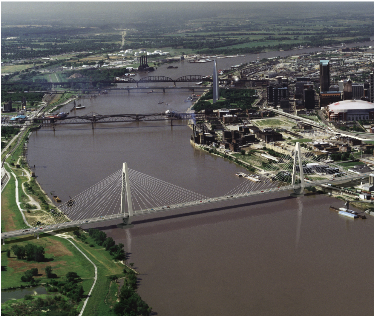
New Mississippi River Bridge (St. Louis, Missouri)