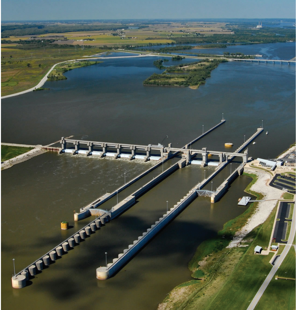
Melvin Price Lock and Dam (East Alton, Illinois)