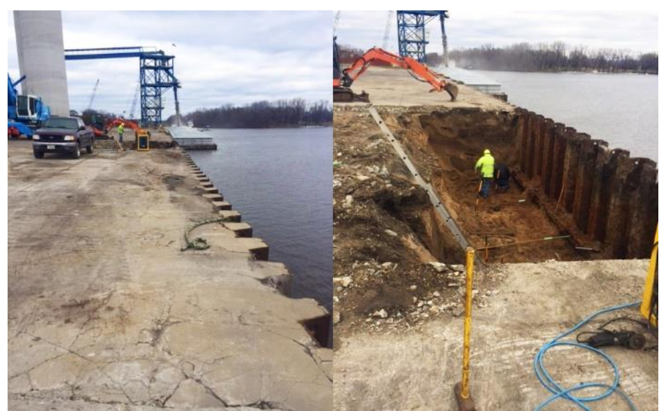
Work underway to repair dock wall failure at F.J. Robers in La Crosse.

F.J. Robers experienced a dock wall failure on 220 feet of a 500-foot dock wall that was built in 1992. This last year, operators were literally able to put a hand shovel through a previously 2-inch-thick dock wall.